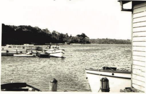
Metung Regatta 1946